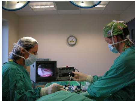
Keyhole spey in progress

At Toachim House, we believe in continually improving our techniques to be able to offer every pet the best treatment and minimising any postoperative pain and discomfort as far as possible. We are pleased to be able to offer laparoscopic ("keyhole surgery") bitch speys .